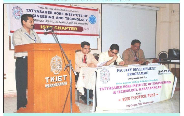
Faculty Development Programme

Career Development Cell (CDC) is organizing different activities for students' bright career prospects. It provides information on Competitive examinations like GATE, GRE, TOFEL, IELTS, MBA etc as well as conducts many guest lectures on soft-skills, personality development, aptitude tests, GD, PI & so on, to guide, inspire & motivate the students that enhances the eligibility and employability of the students in the campus recruitment programs.